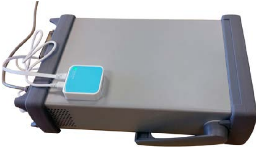
Figure 1. Shown here is a nano router on top of a 34972A with a LAN and power cables.

In general, the nano router offers the basic functionality you need to use it with the 34972A. Its main features are its small size and inexpensive cost relative to the DAQ system.